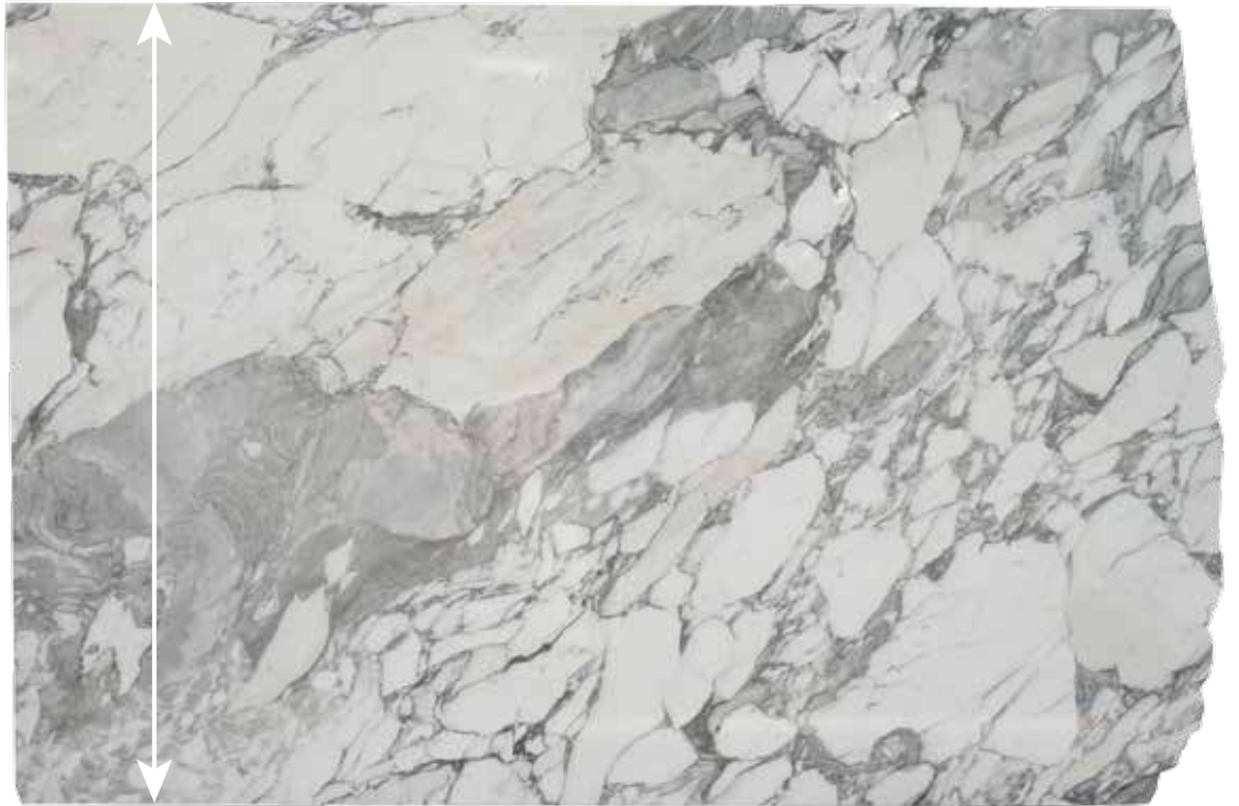
FIGURE 1 ~ SLAB

The vertical line represents the cut made along the edge of the slab to maintain the maximum square footage of the slab.