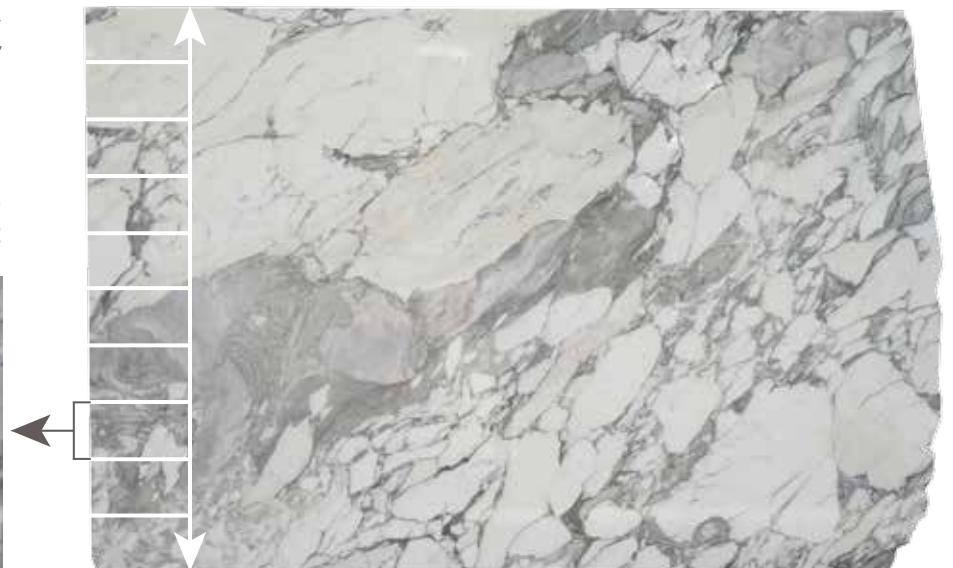
FIGURE 2 ~ SLAB

Looking closer one can see some samples identified here contain more of the darker grey veining than do other samples.