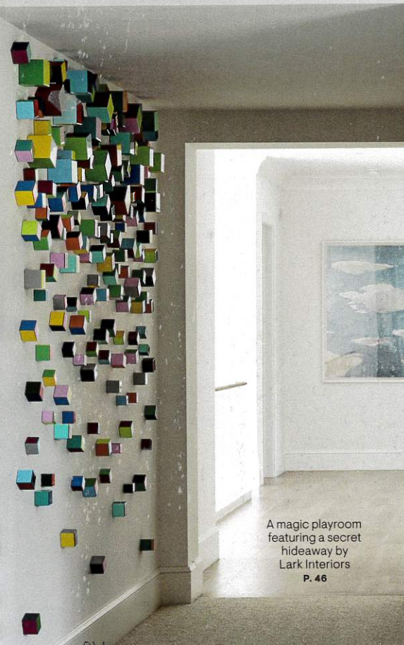
A magic playroom featuring a secret hideaway by Lark Interiors P. 46

AN ENABLER'S GUIDE TO GROWN-UP RENOS At-home Theaters, Spas, and More— Make It Happen Now!