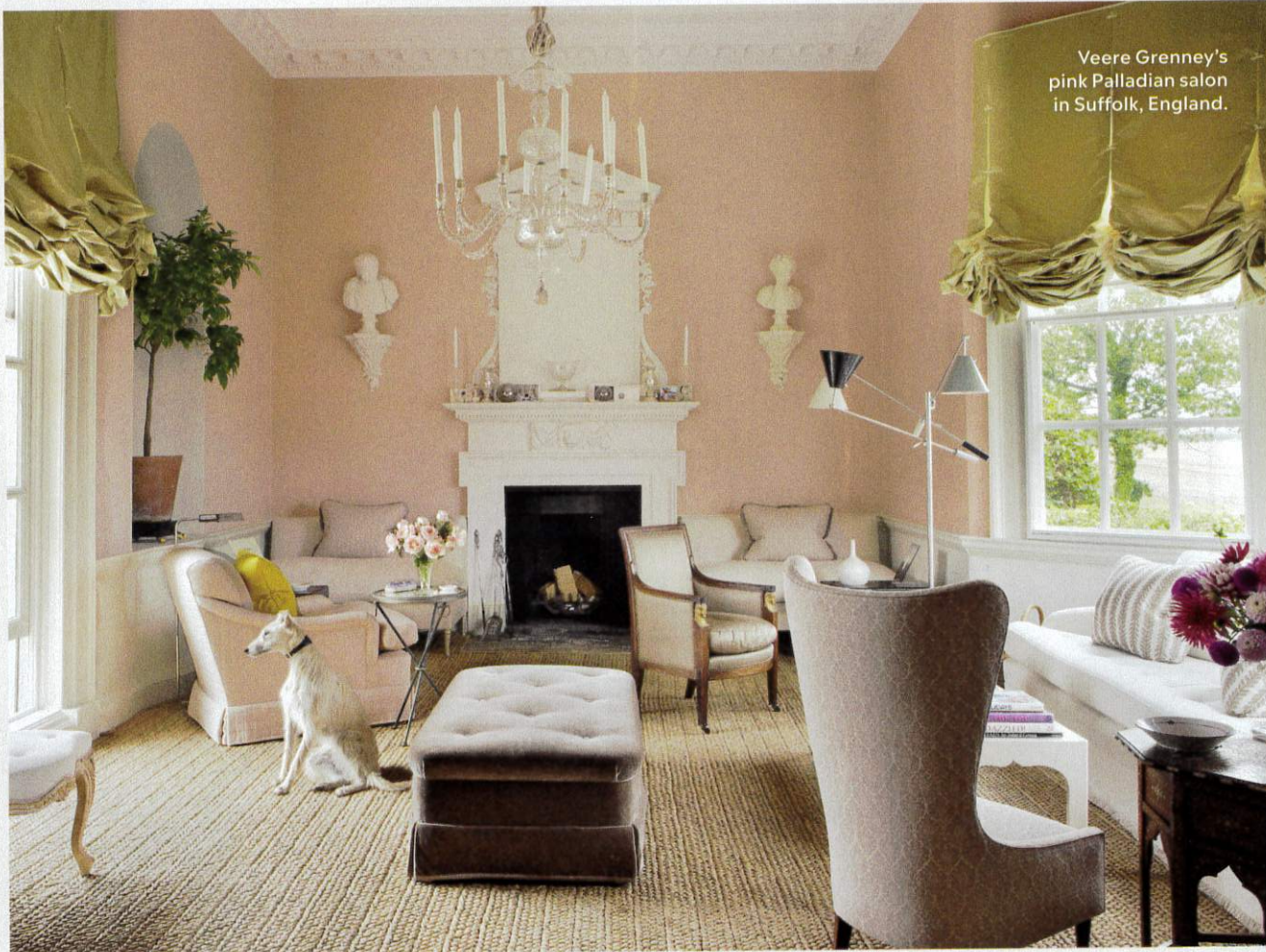
Veere Grenney's pink Palladian salon in Suffolk, England.