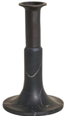
Bronze and Marble Candleholder Valerie Chomarot for When Objects Work, from €200, whenobjectswork.com