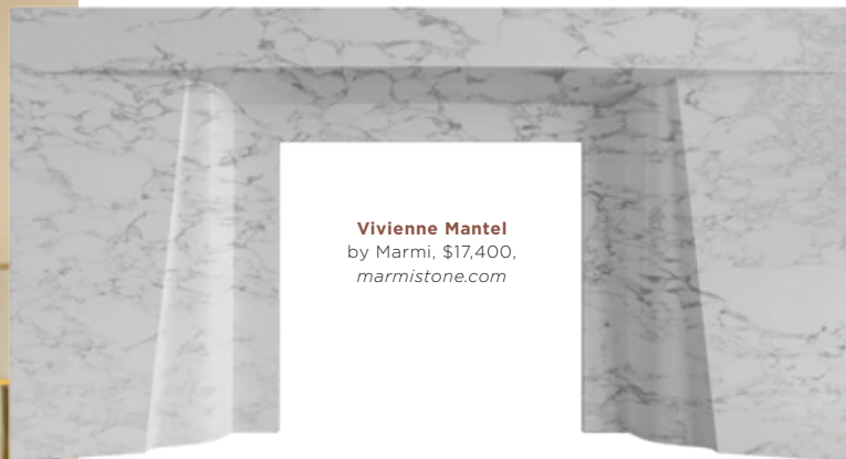
Vivienne Mantel by Marmi, $17,400, marmistone.com