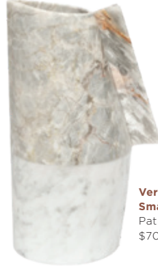
Versi Carafe Small B by Patricia Urquiola, $705, artemest.com