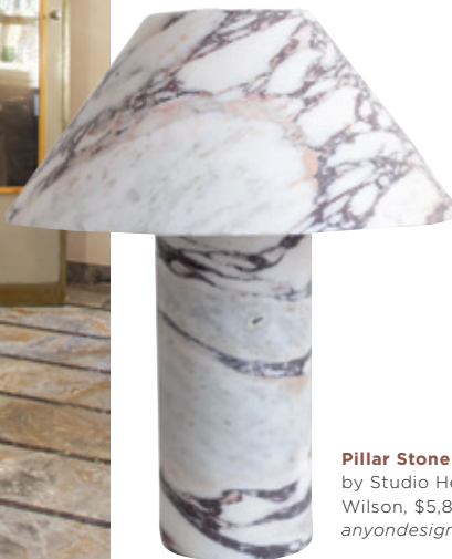
Pillar Stone Light by Studio Henry Wilson, $5,880, anyondesign.com