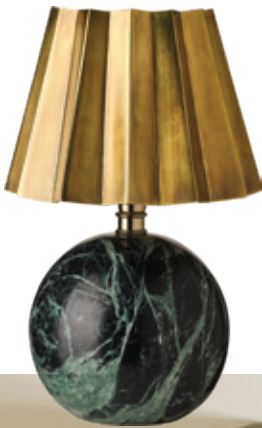
Marble Ball Lamp Base by Matilda Goad, $235 (shown with Pleated Brass Lampshade, $120), us.matildagoad.com