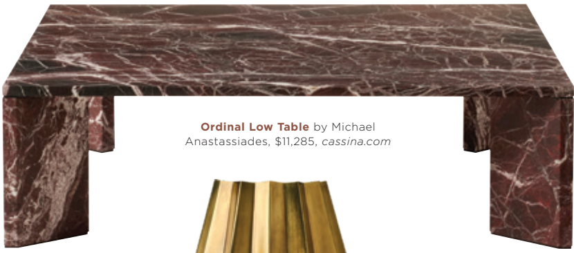
Ordinal Low Table by Michael Anastassiades, $11,285, cassina.com