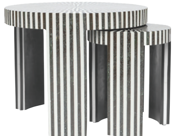
Carlotta Nesting Tables by Made Goods, $4,840 for set of two, madegoods.com

This quietly opulent Art Deco bath in Milan's Villa Necchi Campiglio, designed by Piero Portaluppi between 1932–35 (and now open to the public), showcases the jaw-dropping beauty of marble's bold, natural veining writ large.