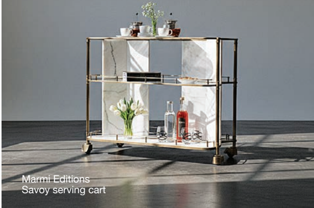
Marmi Editions Savoy serving cart

In 1963, the Abdalla family established Marmonil in Cairo, building the business on quarrying and sourcing natural stone slabs from around the world, including Italy, Portugal, Morocco, and Mexico. In 2006, the now third-generation family business launched U.S. headquarters in the Atlanta area — Marmi Natural Stone, now simply Marmi . Ongoing relationships with designers and architects inspired a new direction: