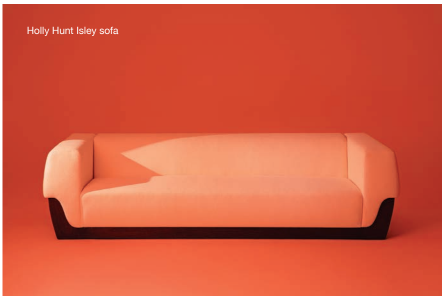
Holly Hunt Isley sofa

Nine pieces — seating, case goods, and occasional tables — push boundaries with sculptural forms, vibrant lacquers, and unexpected proportions. Rich solid wood accents are rendered in ring-cut wood veneer, hand-applied lacquer, and dimpled cast bronze. Every piece is conceived and completed entirely by hand within Holly Hunt's own workrooms. Onward, at Holly Hunt, Dallas Design Center, 1025 N. Stemmons Freeway, hollyhunt.com . RS